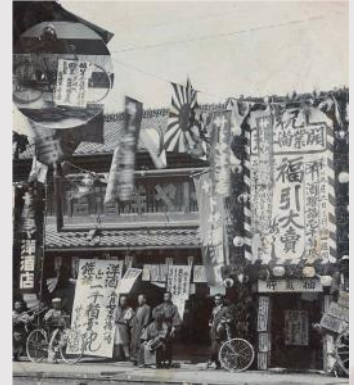
Grand sale of newly opened SADOYA liquor shop. First prize was English bicycle.